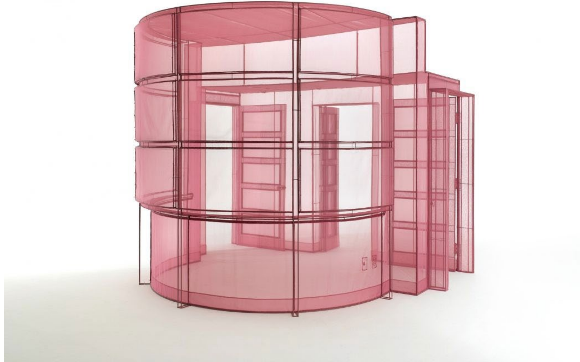
Do Ho Suh, "Hub-2, Breakfast Corner, 260-7, Sungbook-Dong, Sungbo-Ku, Seoul Korea" 2018