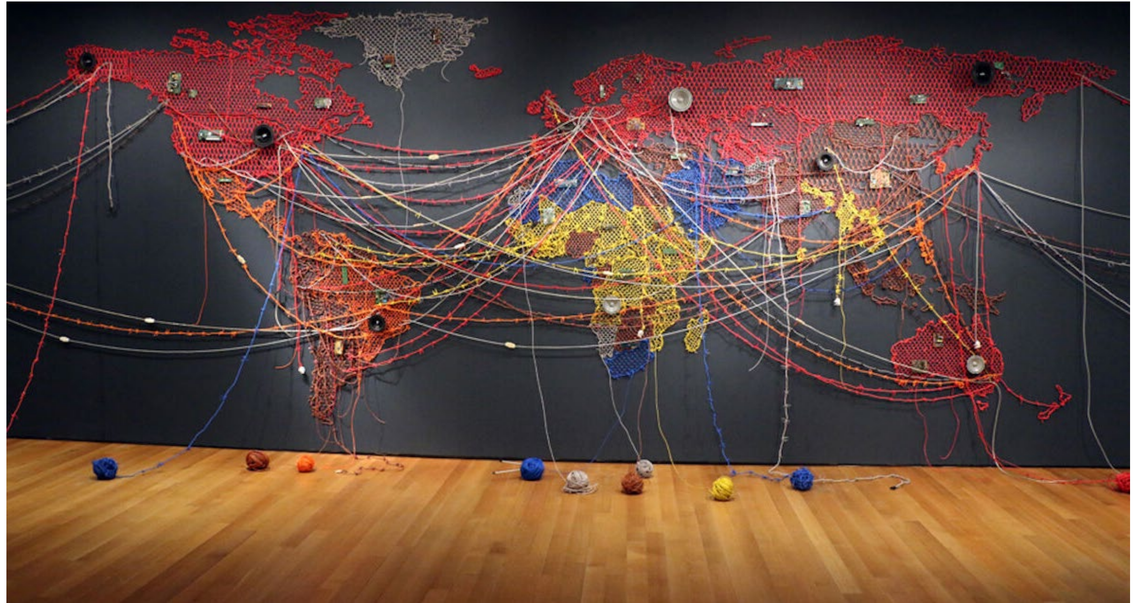
Reena Saini Kallat, "Woven Chronicle," 2011-16

circuit boards, speakers, electrical wires, and fittings; single-channel audio sound approx. 11 x 38 ft